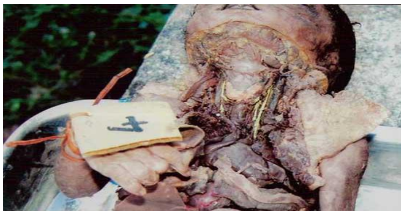
DISSECTION OF NON RLN ON RIGHT SIDE-NORMAL ORIGIN O FRLN ON LEFT SIDE

Fetuses were grouped as II and III trimester based on CR length. Out of 100 randomly collected fetuses 38 were grouped as II trimester and 62 as III trimester of which 73 were male fetuses and 27 were female fetuses.