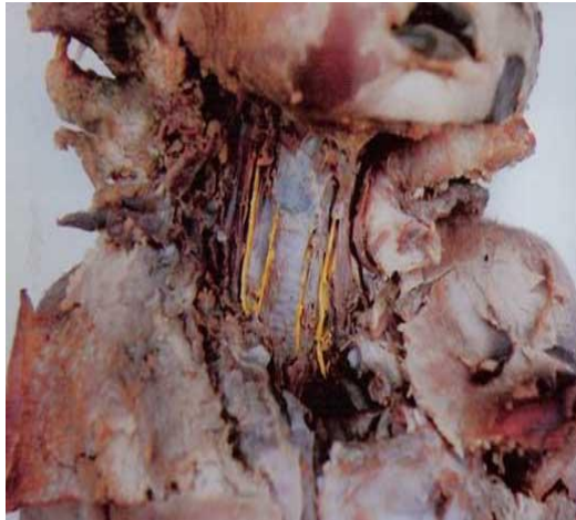
DISSECTION OF VAGUS NERVE AND RLN ON RIGHT AND LEFT SIDES (COLOURED YELLOW)